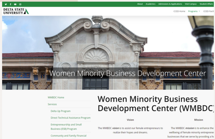
Women Minority Business Development Center